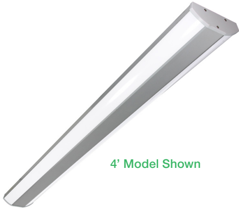
4' Model Shown