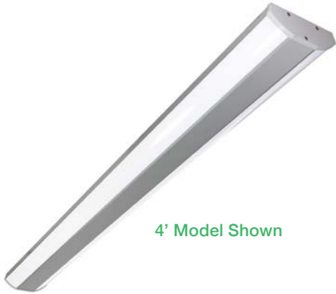
4' Model Shown