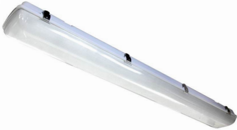
48" LED Vapor Tight w/ Translucent Lens