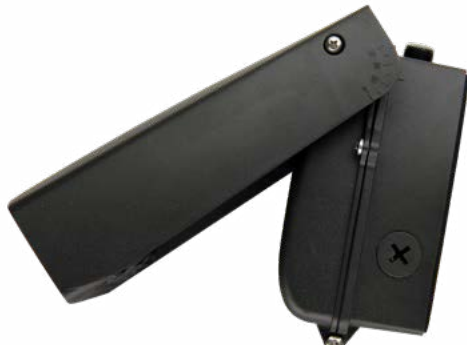
50W & 70W model shown