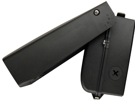
70W model shown