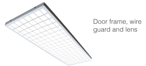
Door frame, wire guard and lens