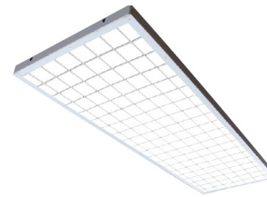
Door frame, wire guard and lens