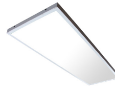
Door frame and lens

Note: Accessories are special order only.