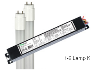
1-2 Lamp Kit