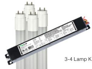
3-4 Lamp Kit