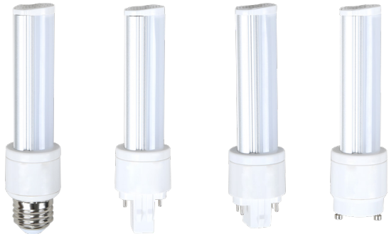
6W E26 6W GX23 6W G24q 6W GU24