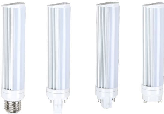
8W E26 8W GX23 8W G24q 8W GU24