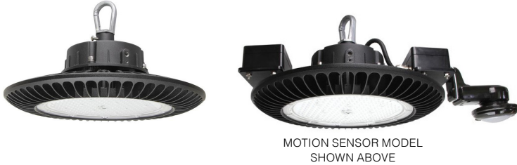
MOTION SENSOR MODEL SHOWN ABOVE