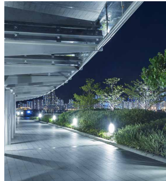
Create comfortable pathways for pedestrians