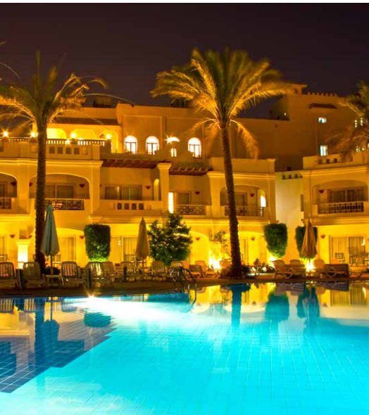
Bring out the beauty of buildings and landscapes