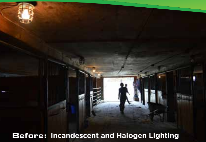
Before: Incandescent and Halogen Lighting