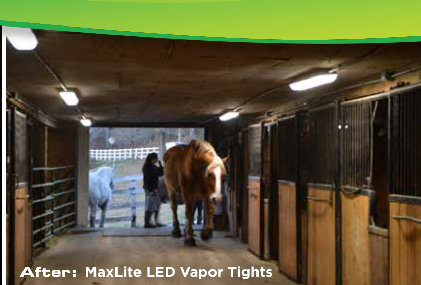
After: MaxLite LED Vapor Tights