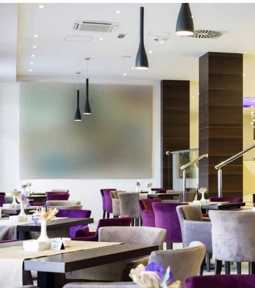
Dramatic lighting and colorful accents set the scene for memorable meals.