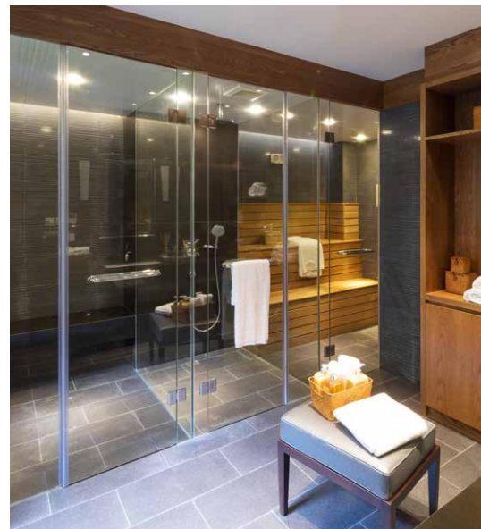
Many of our LED products are damp-listed for use in spas and bathrooms.