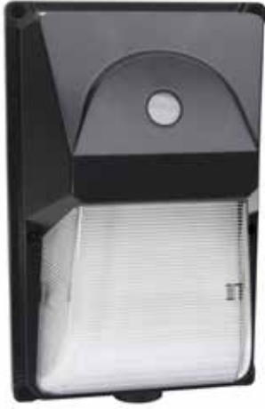
Model # SEC15U50BPC

The GuardMAX LED Entry Wall Pack with dusk-to-dawn photocell provides high quality illumination at 80%+ energy savings for outdoor commercial and industrial environments.