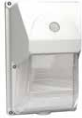
WHITE POLYCARBONATE COVER ALSO AVAILABLE