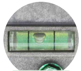
Built In Level