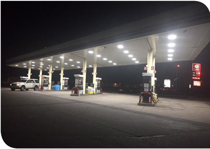
After: The LED lights create a brighter, more inviting station

“They originally had rectangular recessed metal halide fixtures; I wanted to give them a square fixture that updated the overall look of their station, and MaxLite had a fantastic, cost-effective solution.